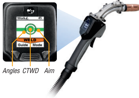
Angles CTWD Aim

ArcStation™ base features a 1/2-inch reversible steel table top and ships complete with drawers, gun holder, quick-release clamps and heavy-duty casters for mobility.