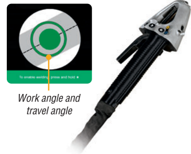
Work angle and travel angle

SmartGun is a glove-friendly, industry-exclusive 400-amp MIG gun featuring built-in LEDs that are tracked by the system's cameras. The ergonomic soft-grip handle provides tactile vibration feedback that helps guide real-time performance adjustments, reinforcing optimal position and movement. The OLED display on the SmartGun provides initial visual feedback to guide proper gun positioning. Pushbuttons provide a convenient alternative to the touchscreen for navigation.